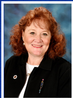
SENATOR • 28 TH DISTRICT LAURA MURPHY SENATORLAURAMURPHY.COM

*Terms and Conditions: This card and reservation process is used to encourage residents of the 28th Senate district to explore and enjoy the arts, sciences, nature and cultural institutions of Chicago. The card can be checked out from Senator Murphy's Office on the day before a constituent wishes to use it. It is limited to four guests at a time with written authorization from the Senator for each location chosen. We kindly request that the card be returned the day after it is used. If you would like to request a card reservation, please contact State Senator Laura Murphy's Office at 847-718-1110 or by emailing laura@senatorlauramurphy.com one week prior to the date you wish to use it. Please note, the Senator may not be able to honor all requests.